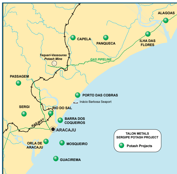
Sergipe Potash Target Locations